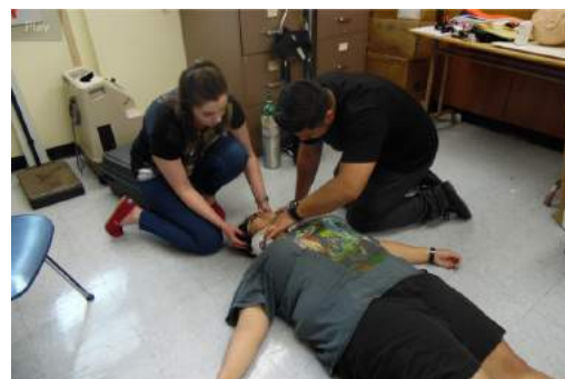
NVOC - First Responders class

What if I told you that there is an alternative option; a pathway that does not align with your traditional post-secondary/higher education journey. What if I told you that there is a Career Technical Education pathway (CTE). CTE programs offer an alternative pathway that provides personalized opportunities which are focused on a students career interest and learning needs. Over the last few months we’ve highlighted schools like Homestead Schools, National Career College, and the Emergency Medical Technician program at Glendale Community College.