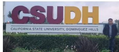
Future mental health care practitioner