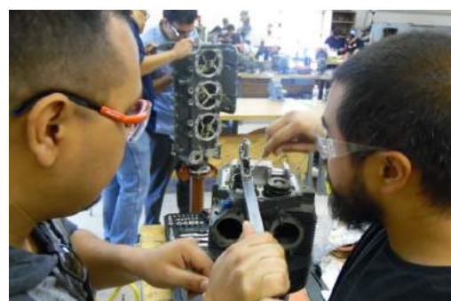
NVOC - Aviation class

But wait, there’s more! The Los Angeles Adult Schools, called Occupational Centers offer an array of FREE CTE programs that are anywhere from 6 months to 2 years! For those of you that live in the San Fernando area, the North Valley Occupational Center offers a wide variety of programs for FREE . One of their Aircraft Mechanic Technician Program, their most recognized, is being offered at NO COST to students! Additionally, the NVOC has Administrative, Automotive, Electrical, Graphic Design, Medical Assistant, LVN, and more! To learn more about their course offerings you can visit their website at NVOC.ORG