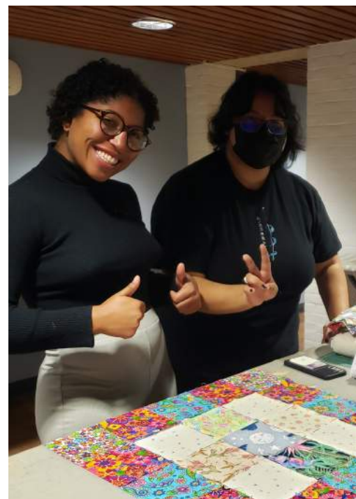
Getting crafty and feeling proud.

I've really enjoyed being here but it's definitely different. Colby College is located in Waterville, Maine which is about 100 miles away from the Canadian border. There are no freeways, only highways and there are trees everywhere. People here are welcoming and it's nice meeting individuals from different cultural backgrounds. It's eye-opening how people's perspectives are different and how they view certain topics like politics and religion. Waterville is a small town that has European and Canadian influences. I really enjoy learning about different cultures and customs. Since being here, I've only seen a handful of Mexicans which is a huge difference from Los Angeles. Overall, I've embraced Colby and I continue learning in and out of the classroom.