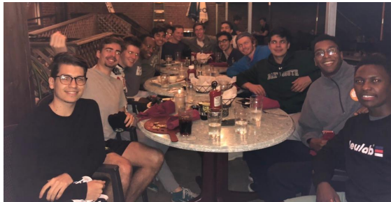
ENJOYING A FAREWELL DINNER WITH HIS SOCCER TEAM FOR GRADUATING SENIORS. (FRONT LEFT)