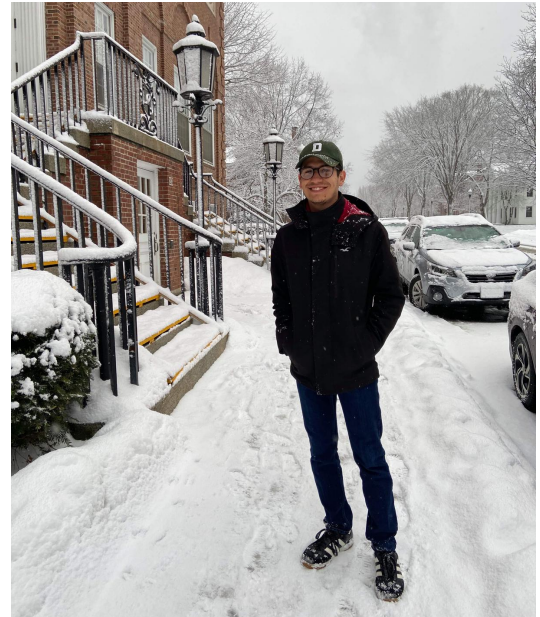
TYPICAL WINTER WEATHER ON THE EAST COAST. THE AVERAGE LOW TEMPERATURE IS AROUND 8°. HOW DID THIS CALI BOY SURVIVE THE WINTERS? A WARM JACKET, GLOVES, AND LOTS OF SWEATERS!